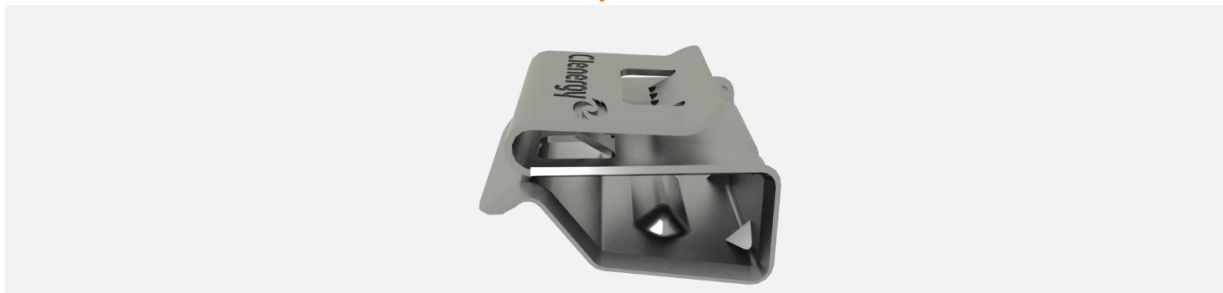
Universal Cable Clip for PV Panels for holding 2 cables Part No.: EZ-CC-PV/2